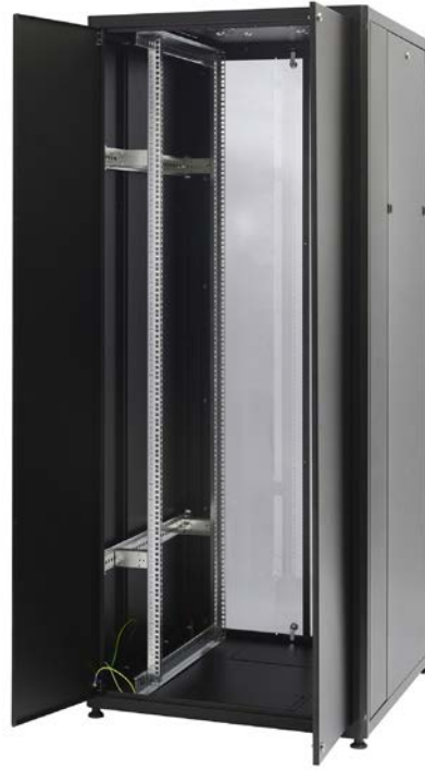
800 x 800 Rear Open