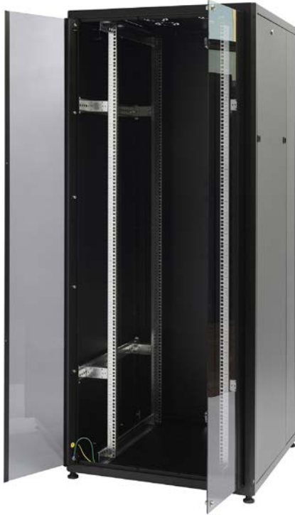
800 x 800 Front open