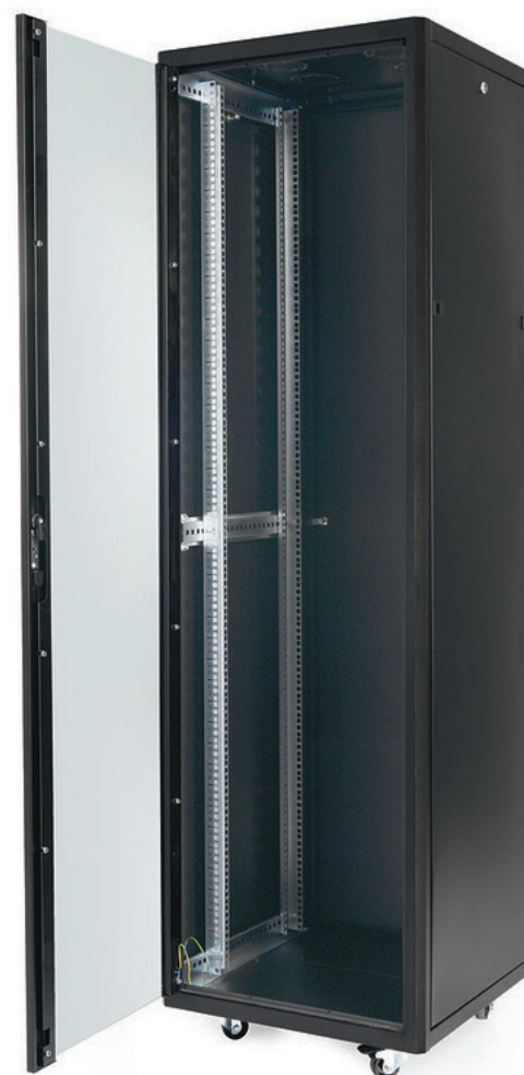
600 x 800 Front Open

A full range of cabinet accessories are available including; wall mounting frames, PDUs, fixed shelves, telescopic shelves, castors, cage nuts, baying kits, roof mounting fan units and plinths. See the cabinet accessories page.