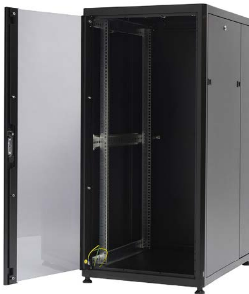
800 x 600 Front Open